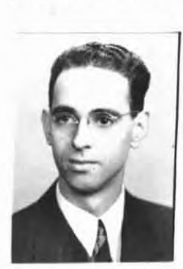
Torride Os arthur