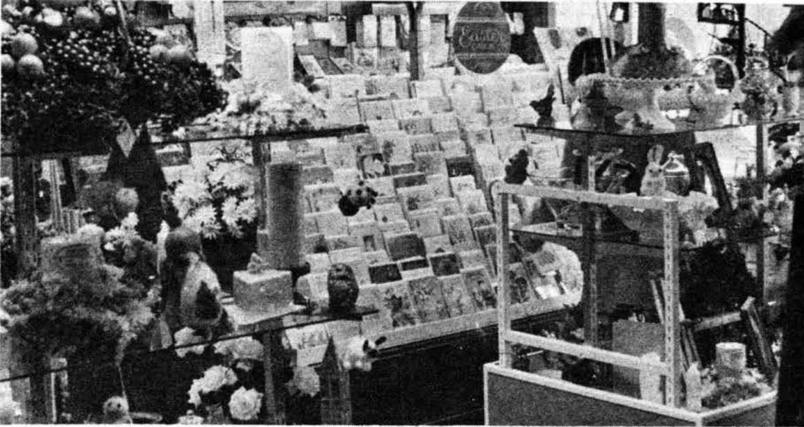
Just a peek at a few of the lovely items available at has a large selection of greeting cards and stationery Gifts N' Things, 1700 West Station Street. The shop as well as fine gifts.