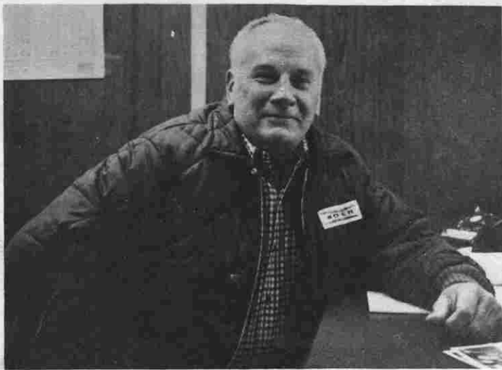
OLD TIMER OF THE WEEK