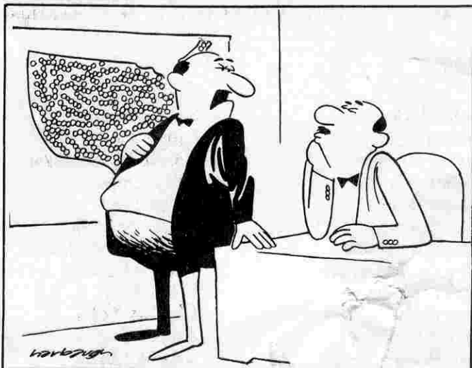
"Last week, three of our own salesmen called on us."

This Old Timer is a camper and gardener in his spare time and is an avid basketball fan on the High School and grade school level.